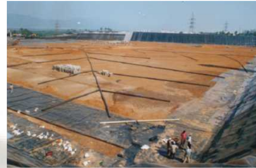
View of perforated pipes laid for leachate collection