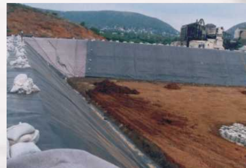
A view of geomembrane installation on slopes at HZL Vizag