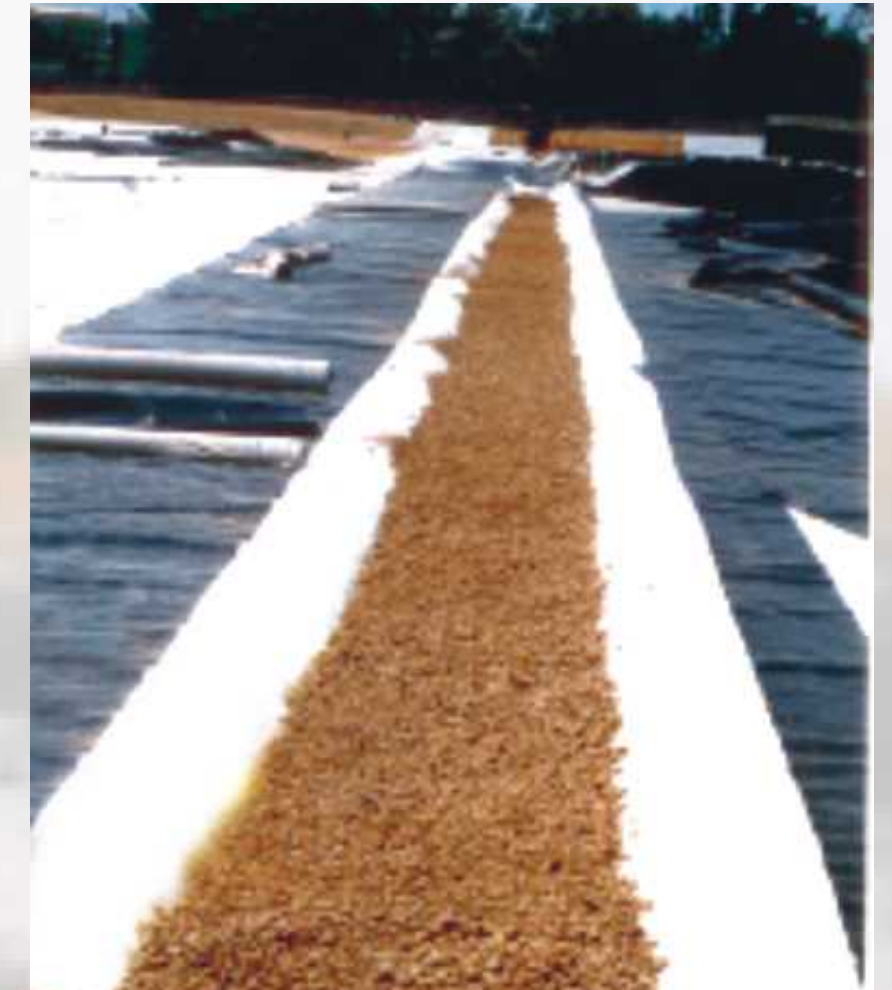
Leachate collection trench filled with rounded aggregates