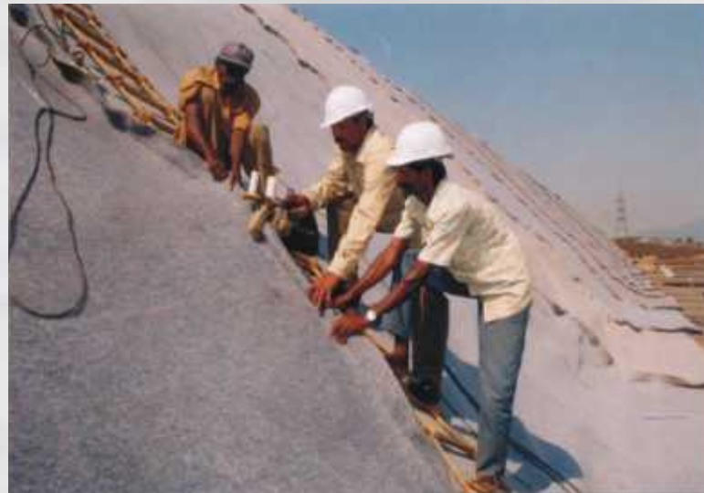
Laying of nonwoven geotextile over slope at HZL Vishakhapatnam site.