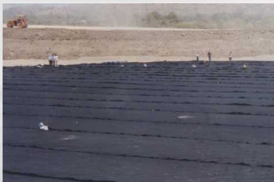
Nonwoven geotextile as protection layer at HZL, Udaipur