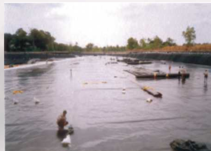
Geomembrane laid on bottom of landfill at Binani Zinc, Cochin.