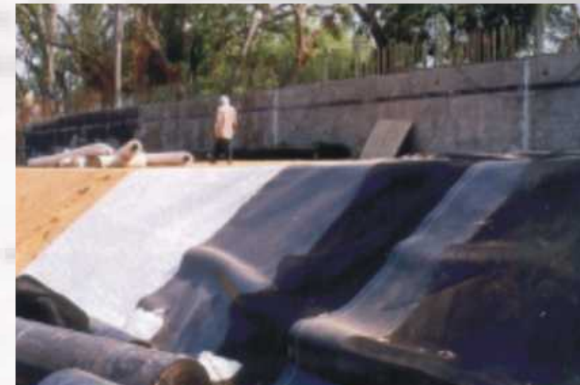
GCL, Geomembrane 1st layer, Geonet 1st layer, Geomembrane 2nd layer, Geonet 2nd layer installed at Binani Zinc, Cochin site